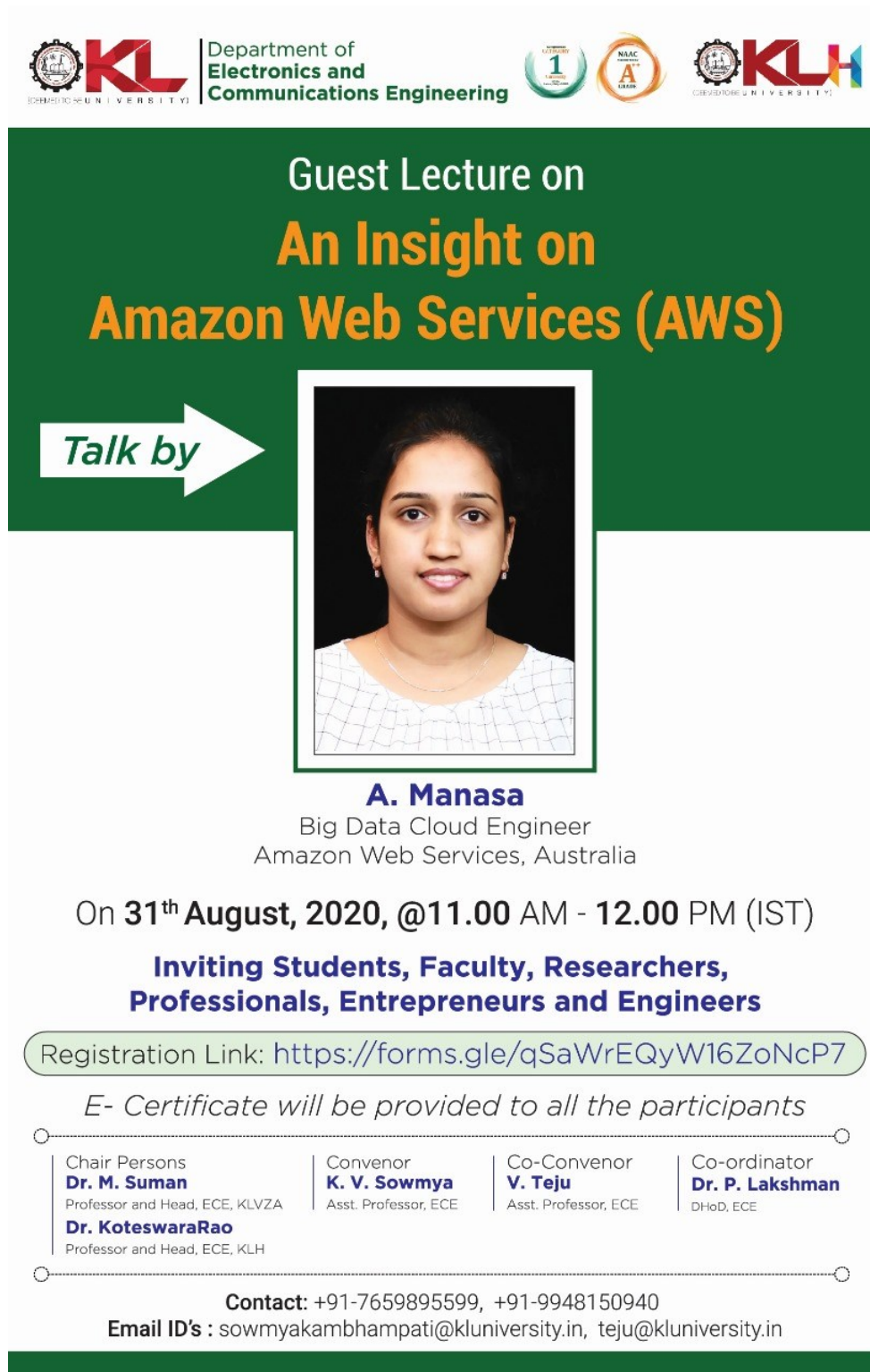
Fig. Poster of webinar